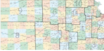
Click map to enlarge.

Let's keep up the good work and keep encouraging our members to renew. Without their membership The American Legion cannot support our veterans, their families and the other programs provided by The American Legion. Let's congratulate Tonganoxie Post 41, for reaching 100% before the end of 2025. Perry Post 42 for reaching 100% before the end of the 2025-2026 year.